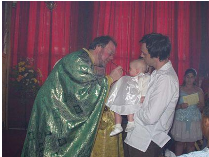
Mission to Go Ahead in Macclesfield (31st May)