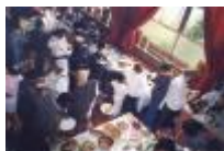
Pascha Party Time