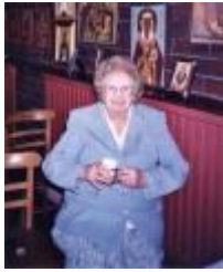
Magdalene in church