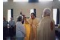
Magdalene's chrismation into the Orthodox Church