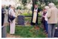
Trisagion Prayers at the Grave on Bright Monday