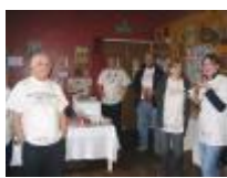
The Clean Up Team