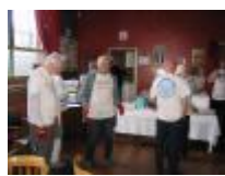
The Clean Up Team