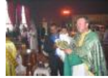
The Procession Around the Font