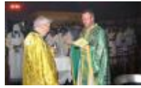
The Blessing of the Oil