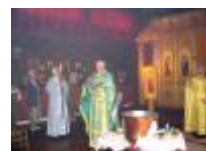
Censing the Font