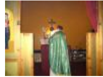
Nuod brought into the Church and then the Altar