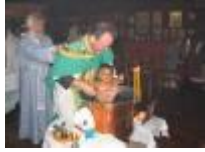
The Baptism of Nuod