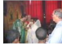
Nuod's First Holy Communion