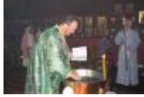
Signing of the Waters with the Cross