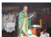
Consecration of the Waters