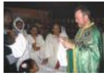
The Baptismal Garment