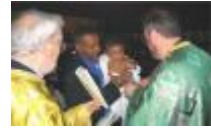
The Anointing of Nuod