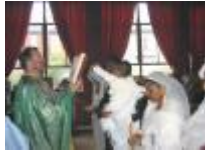
The Reading of the Holy Gospel