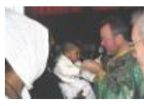
The Offering of Hair