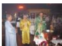
The Prayers of Exorcism