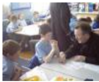
A Helping Hand