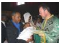
Prayer for Nuod