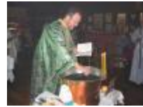
The Anointing of the Waters