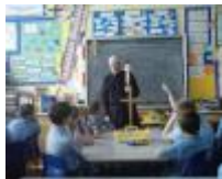
The Holy Cross