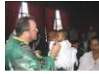
The Chrismation of Nuod